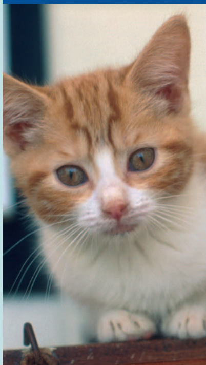
BELOW: Kitten in an RSPCA animal centre