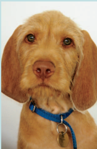
ABOVE: Hungarian wire-haired vizsla