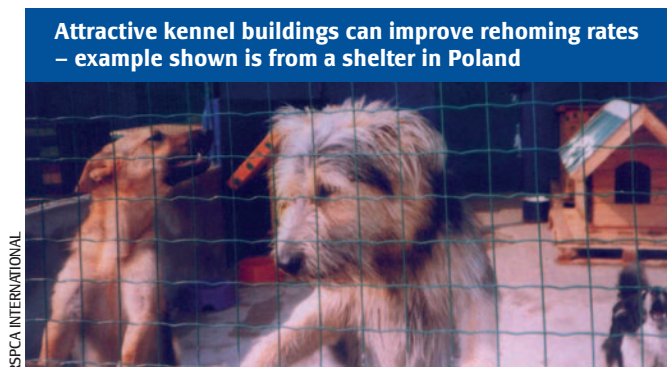
Attractive kennel buildings can improve rehoming rates – example shown is from a shelter in Poland