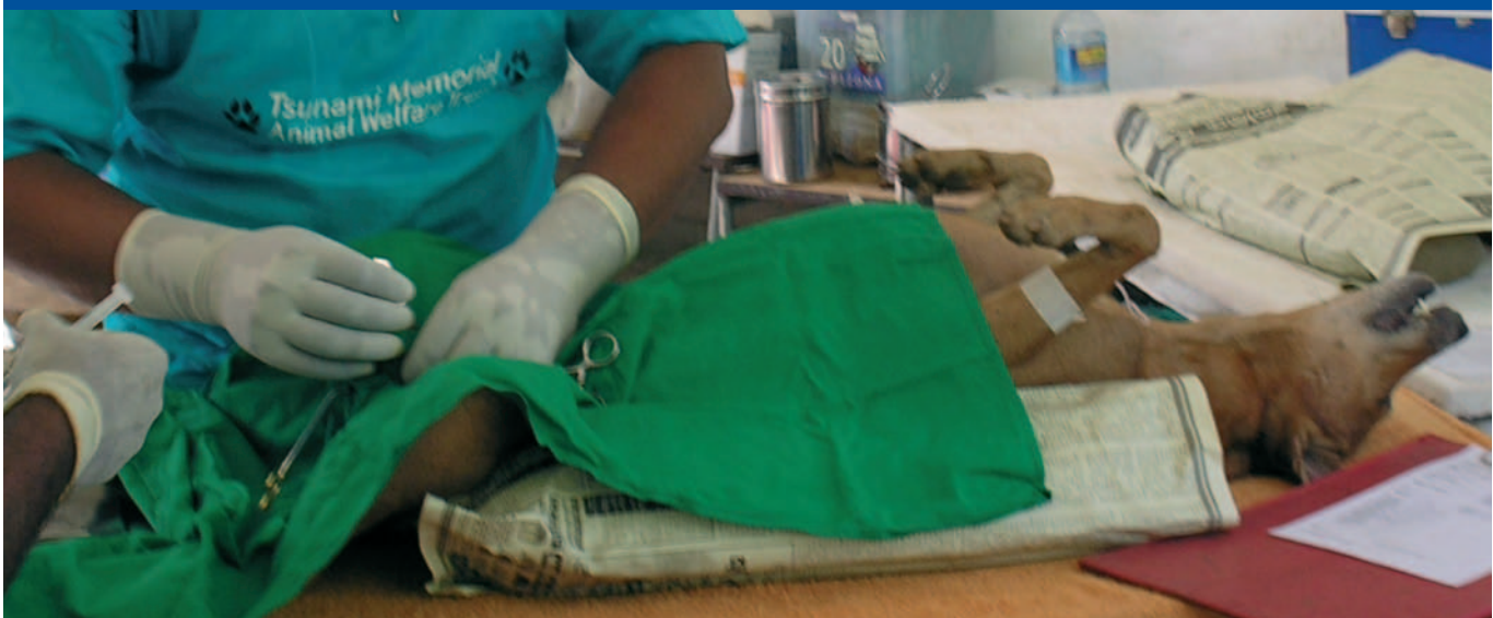
Neutering policy being put into practice in Sri Lanka

This option is more expensive than neutering males, however, the benefits are that it reduces the risk of pyometra (infection of the uterus) and may improve chances to rehome as the female will not come into season.