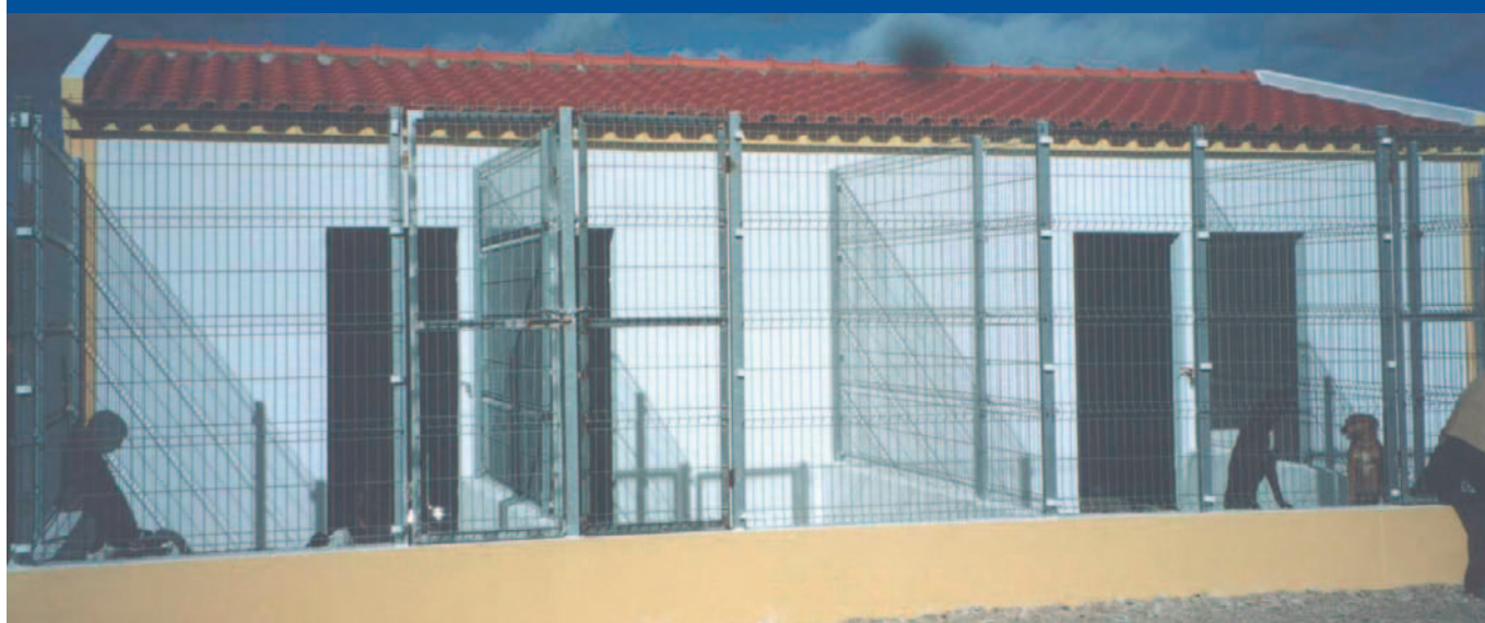
Kennel block at Java animal shelter, Portugal

By providing sufficient space, proper facilities and appropriate company of the animals' own kind.