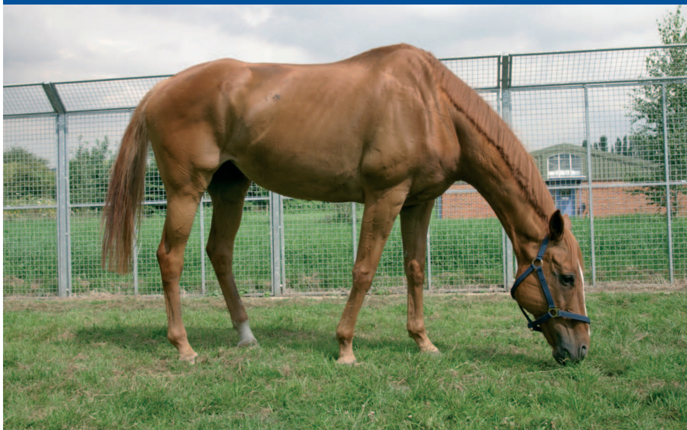
Horse in an RSPCA animal centre

The small animals block will need to be equipped with appropriate food and equipment, e.g. cages.