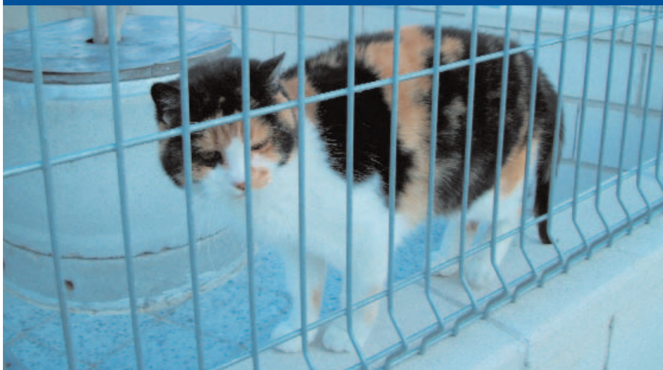
Cattery at an animal shelter in Madrid

Refer to the appendix for examples of these forms.